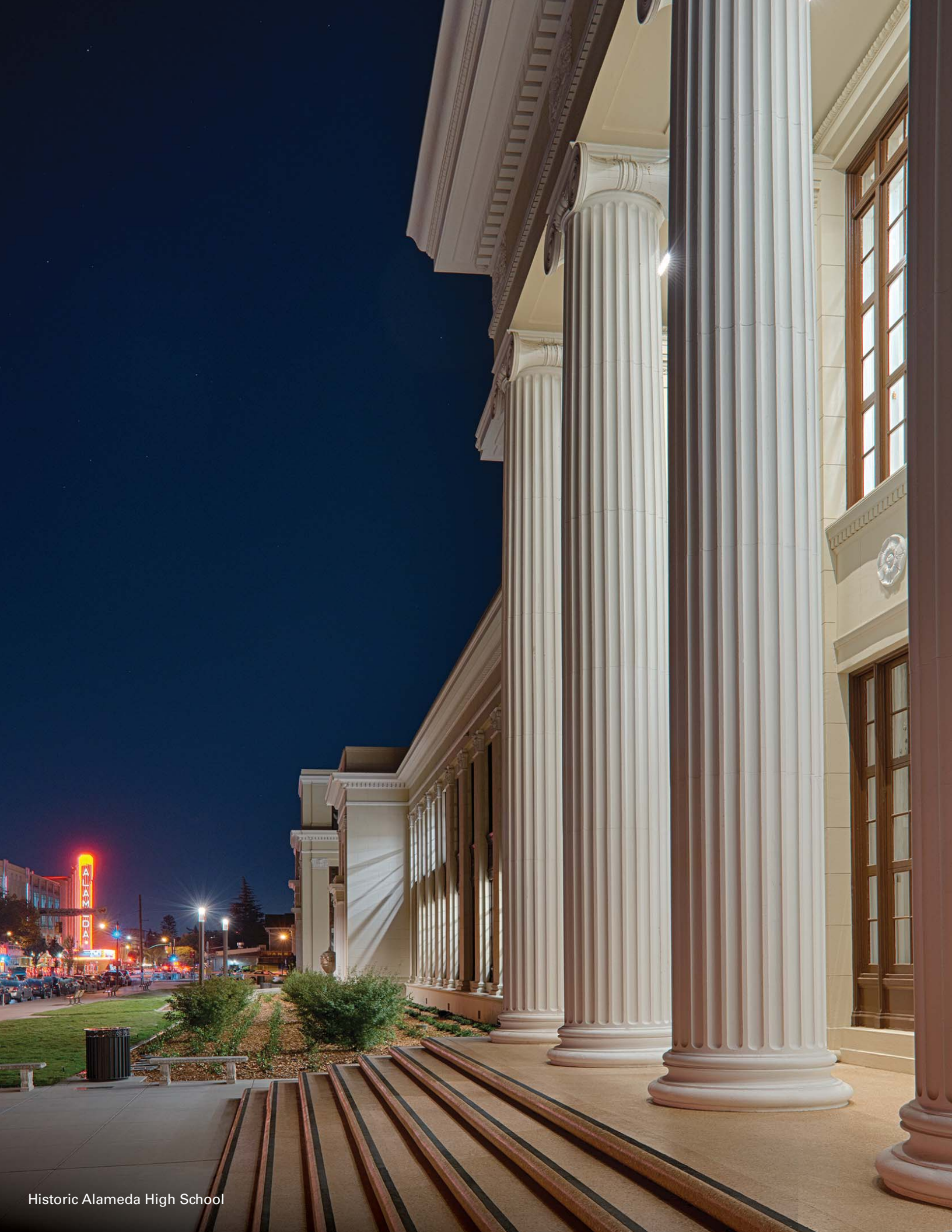
Historic Alameda High School