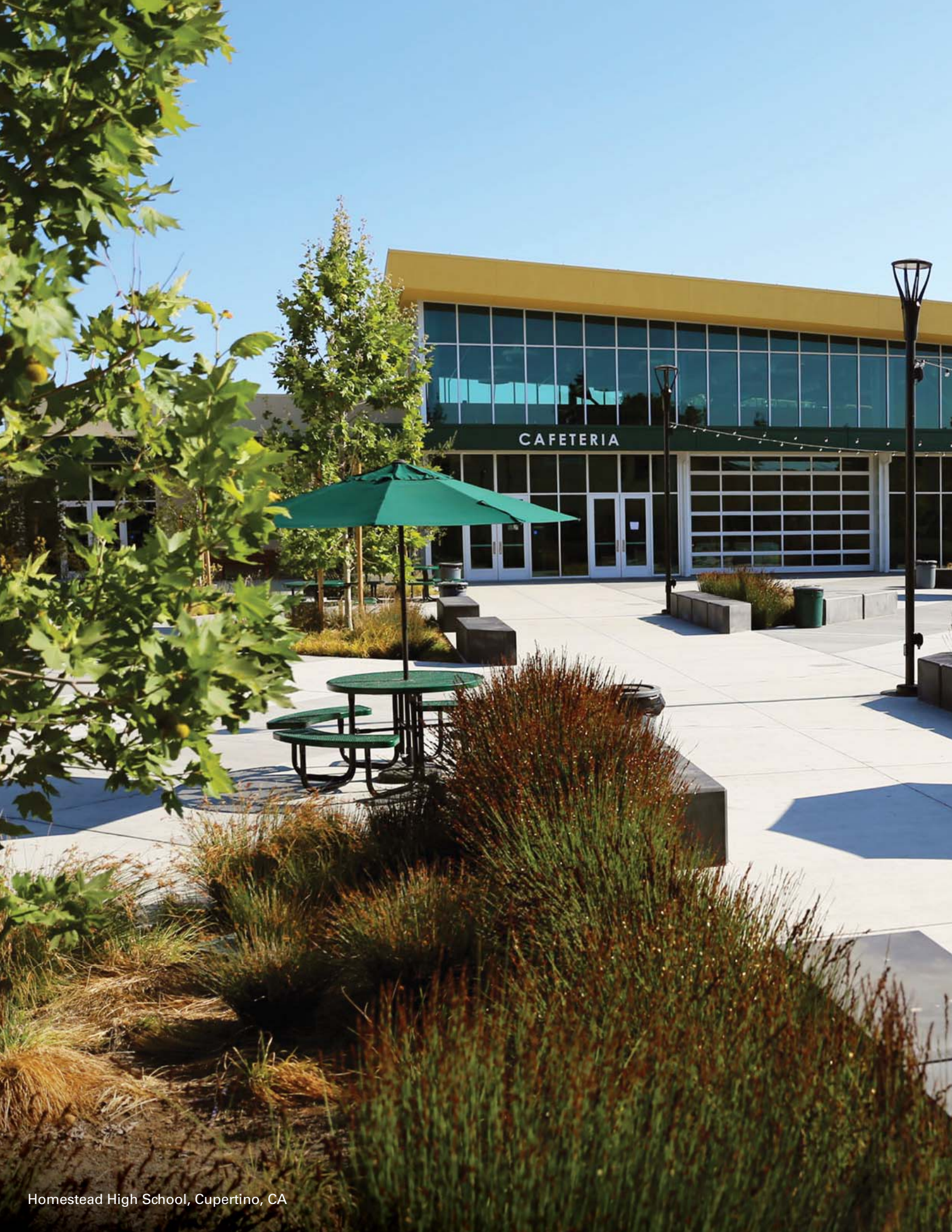
Homestead High School, Cupertino, CA