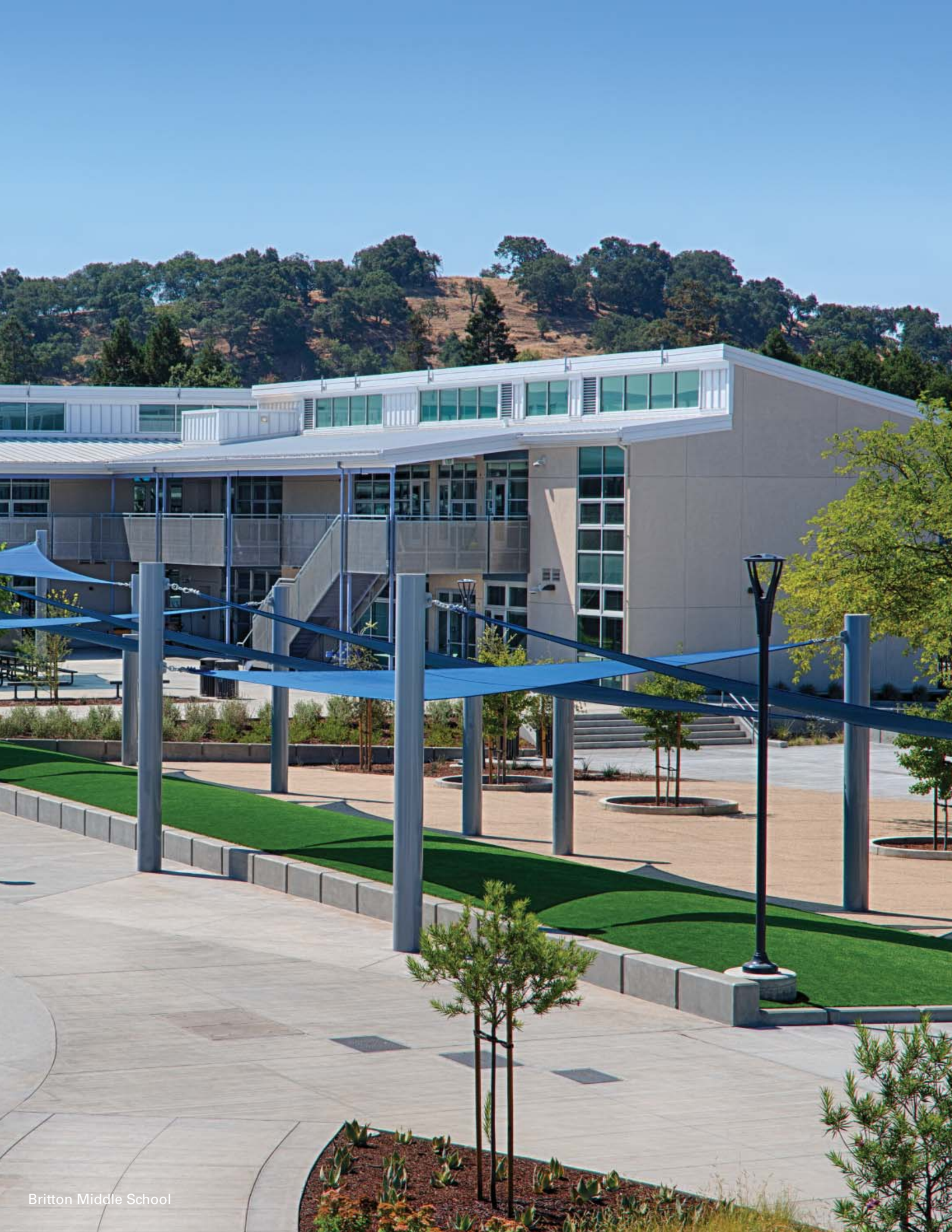
Britton Middle School