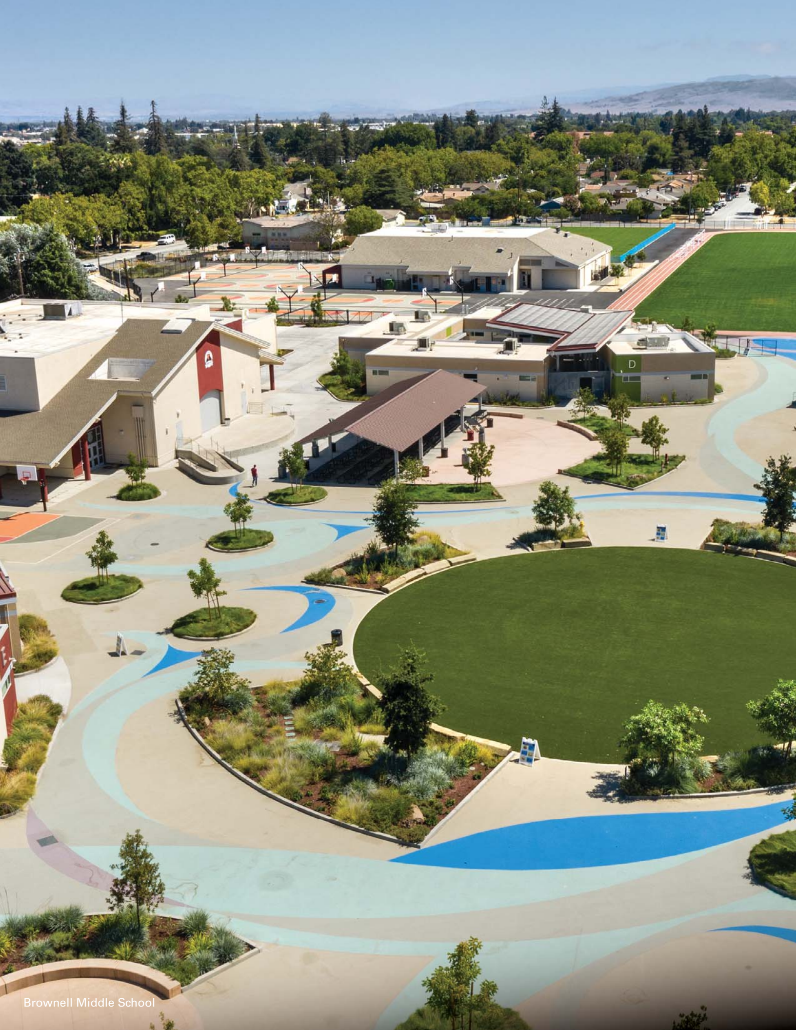
Brownell Middle School