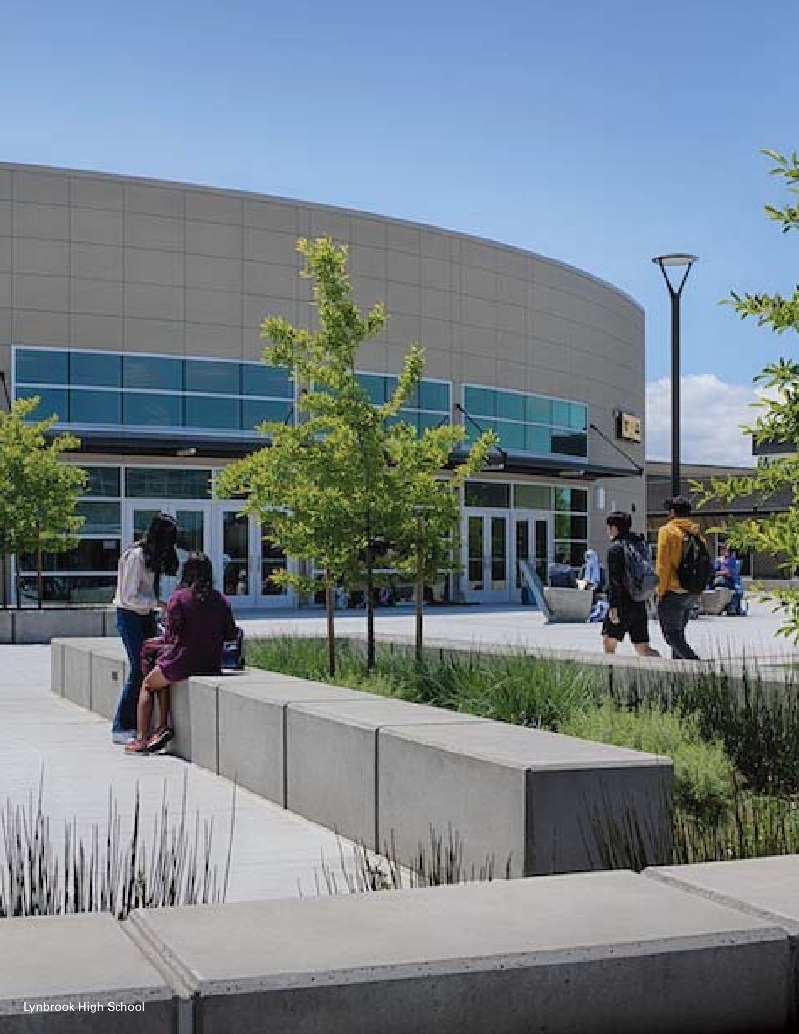
Lynbrook High School