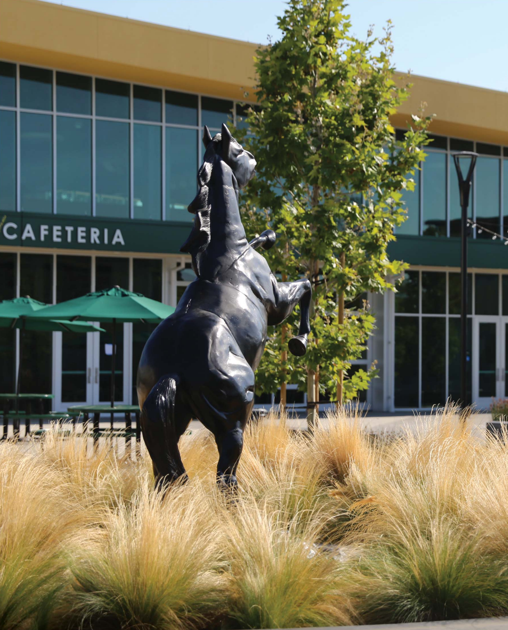
Homestead High School