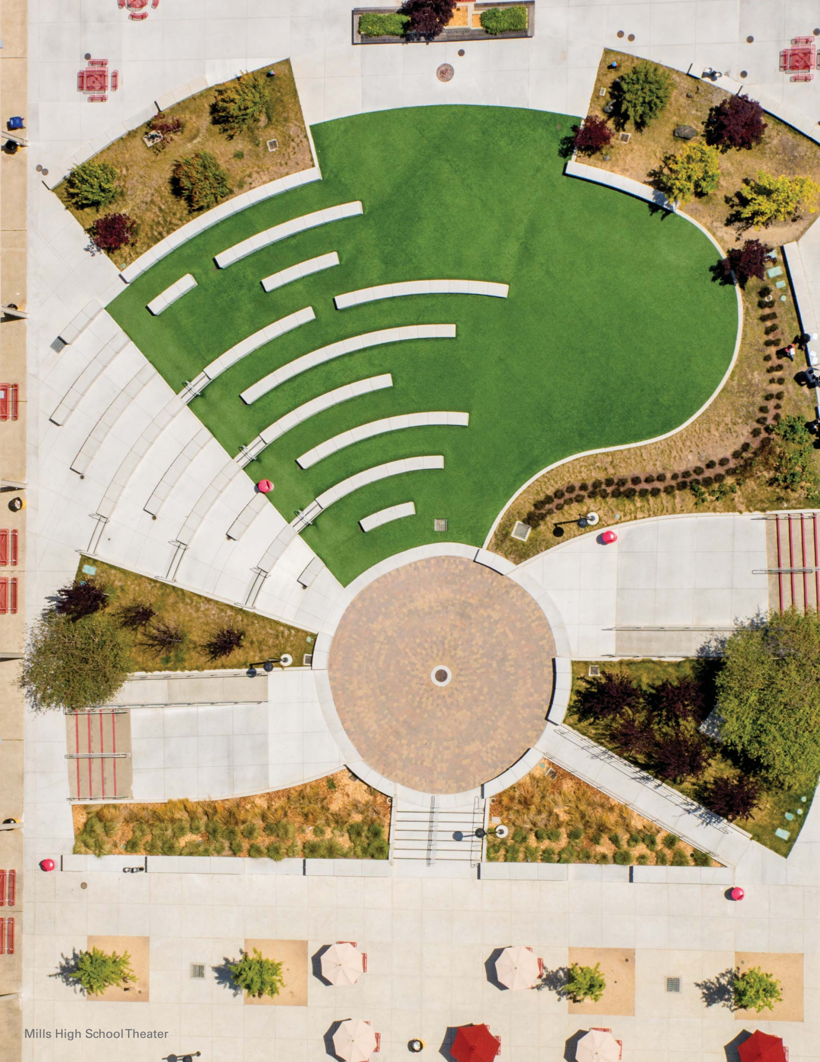
Mills High School Theater