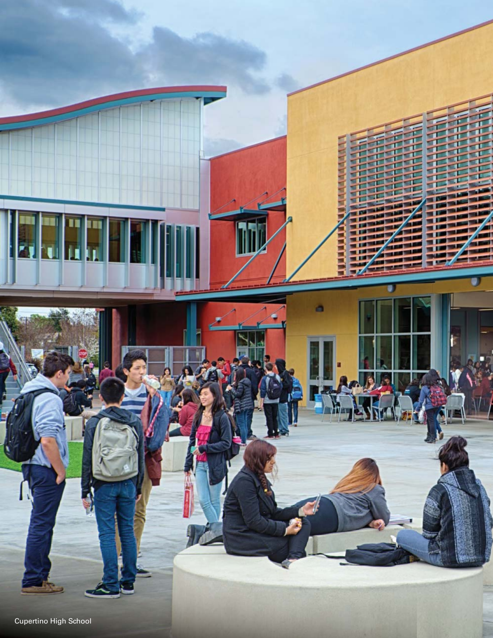
Cupertino High School