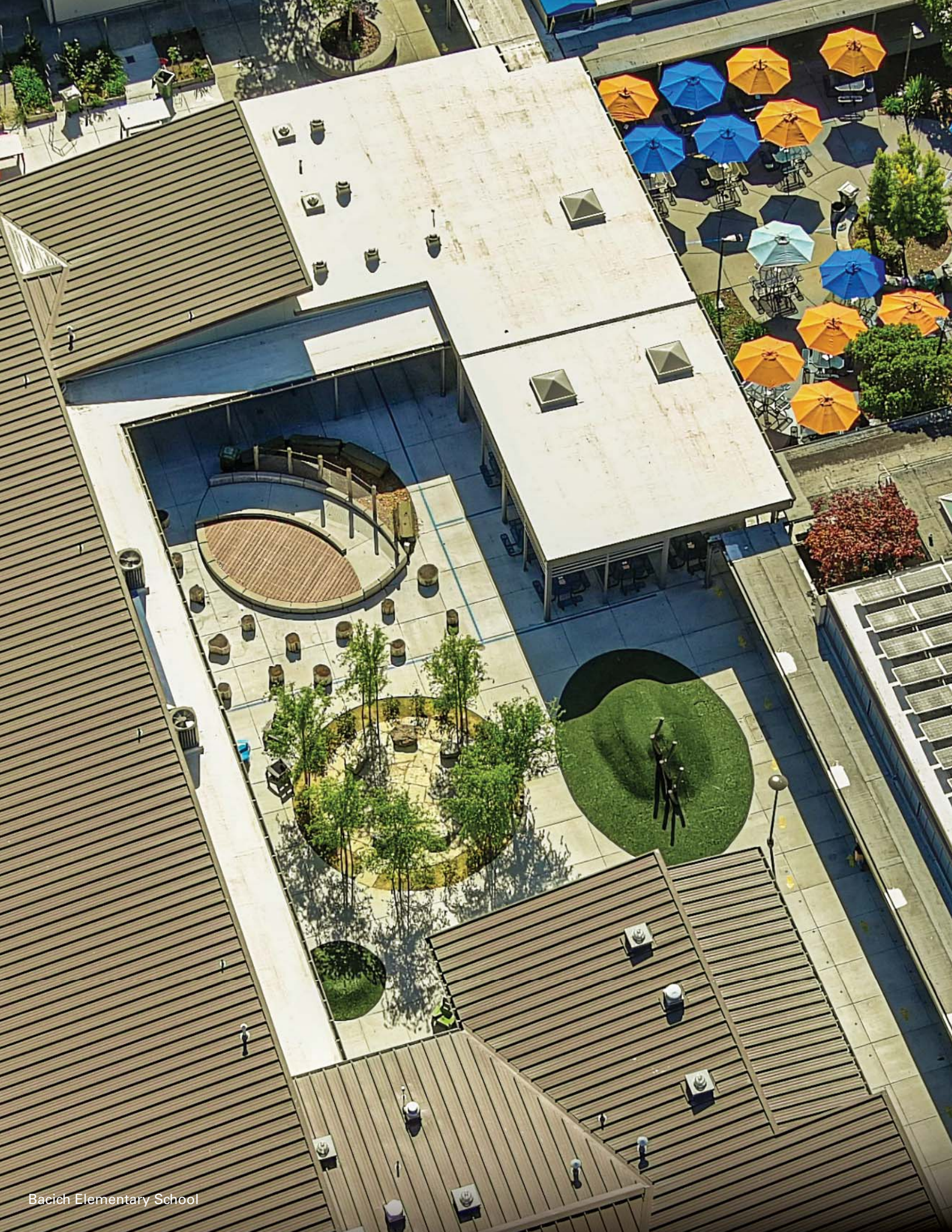
Bacich Elementary School