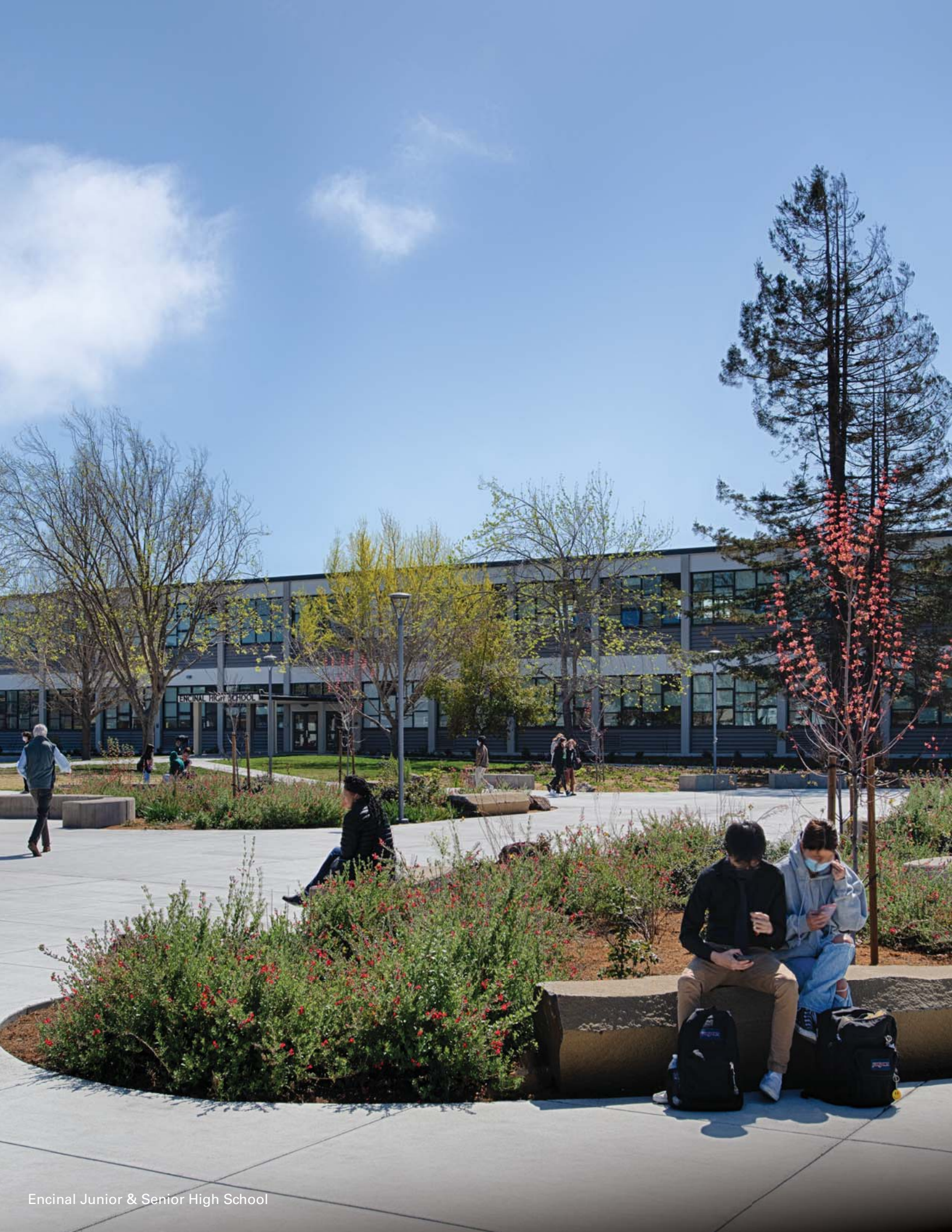
Encinal Junior & Senior High School