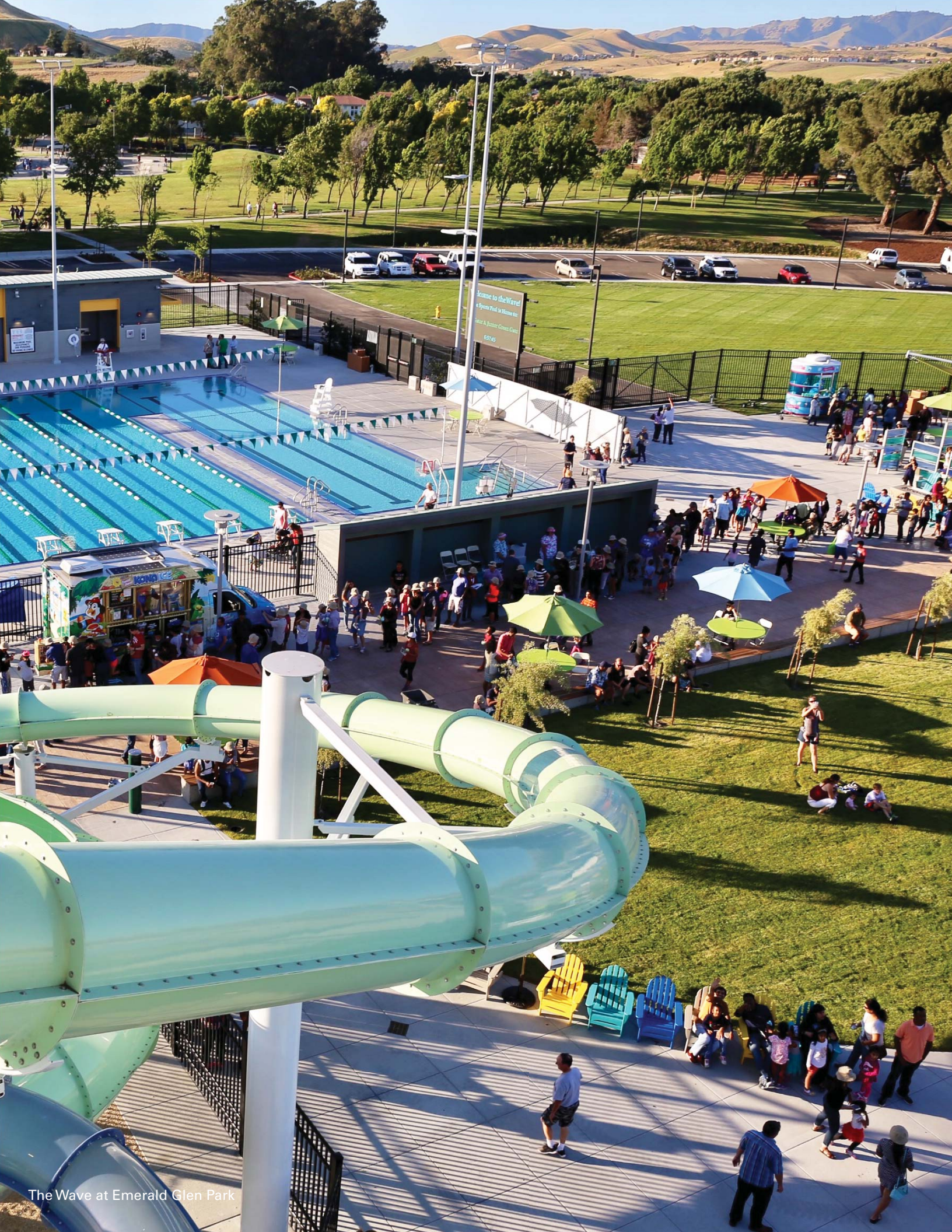
The Wave at Emerald Glen Park