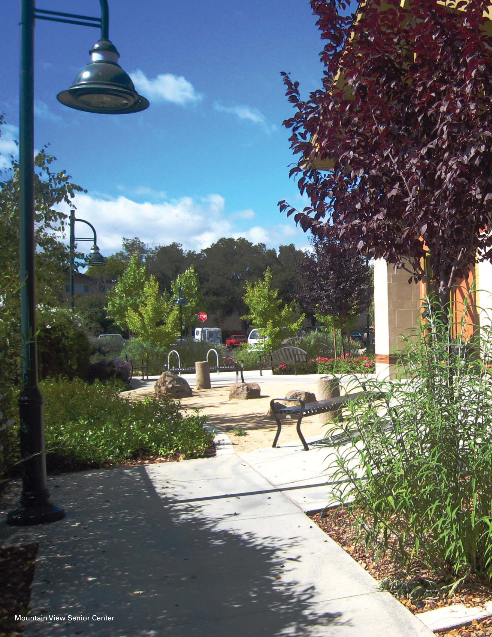
Mountain View Senior Center